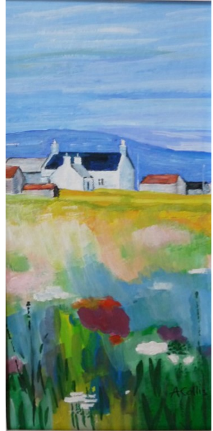
Title: "Scottish Landscape" Medium Gouache Price