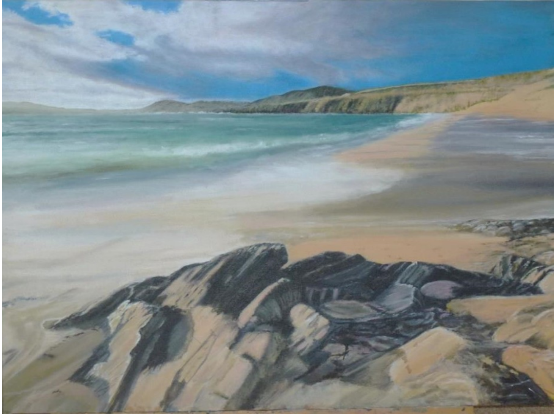
Title: "Scottish Beach" Medium Acrylics Price PoA