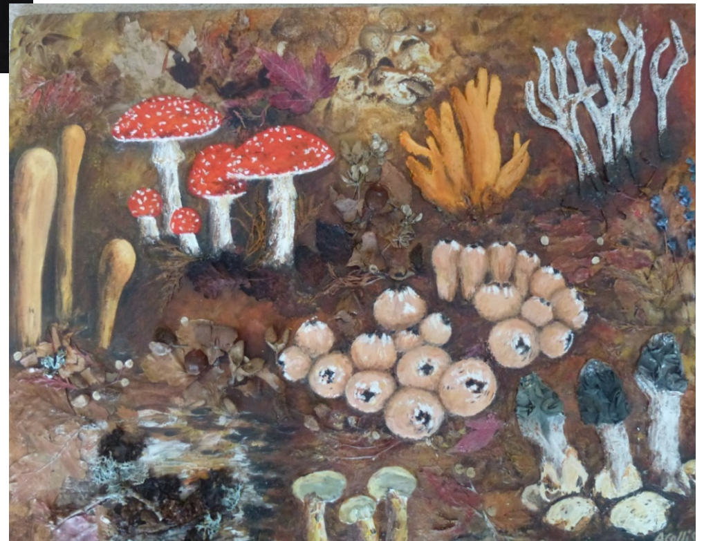
Title: "Fungi" Medium Mixed media Price £80