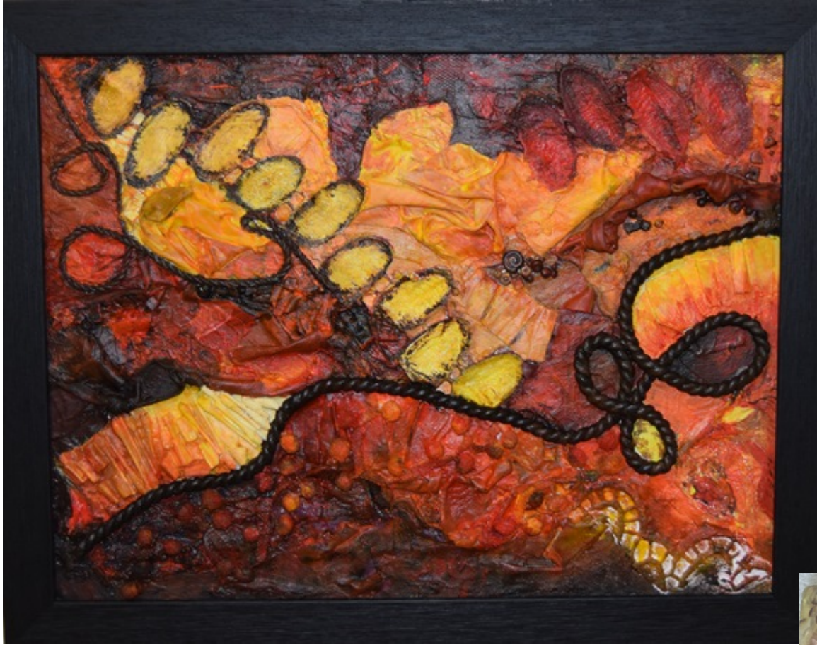
Title: "Tribal" Medium Acrylic/Mixed media Price £70