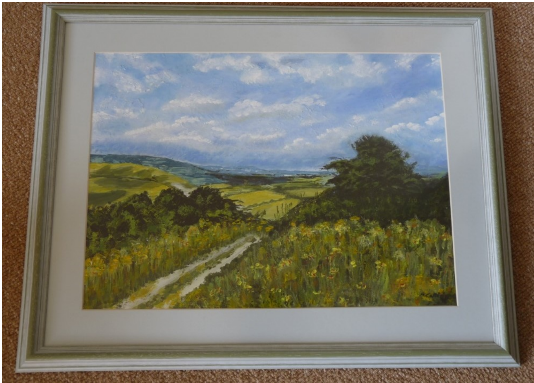
Title: "Summers Day" Medium Acrylic Price