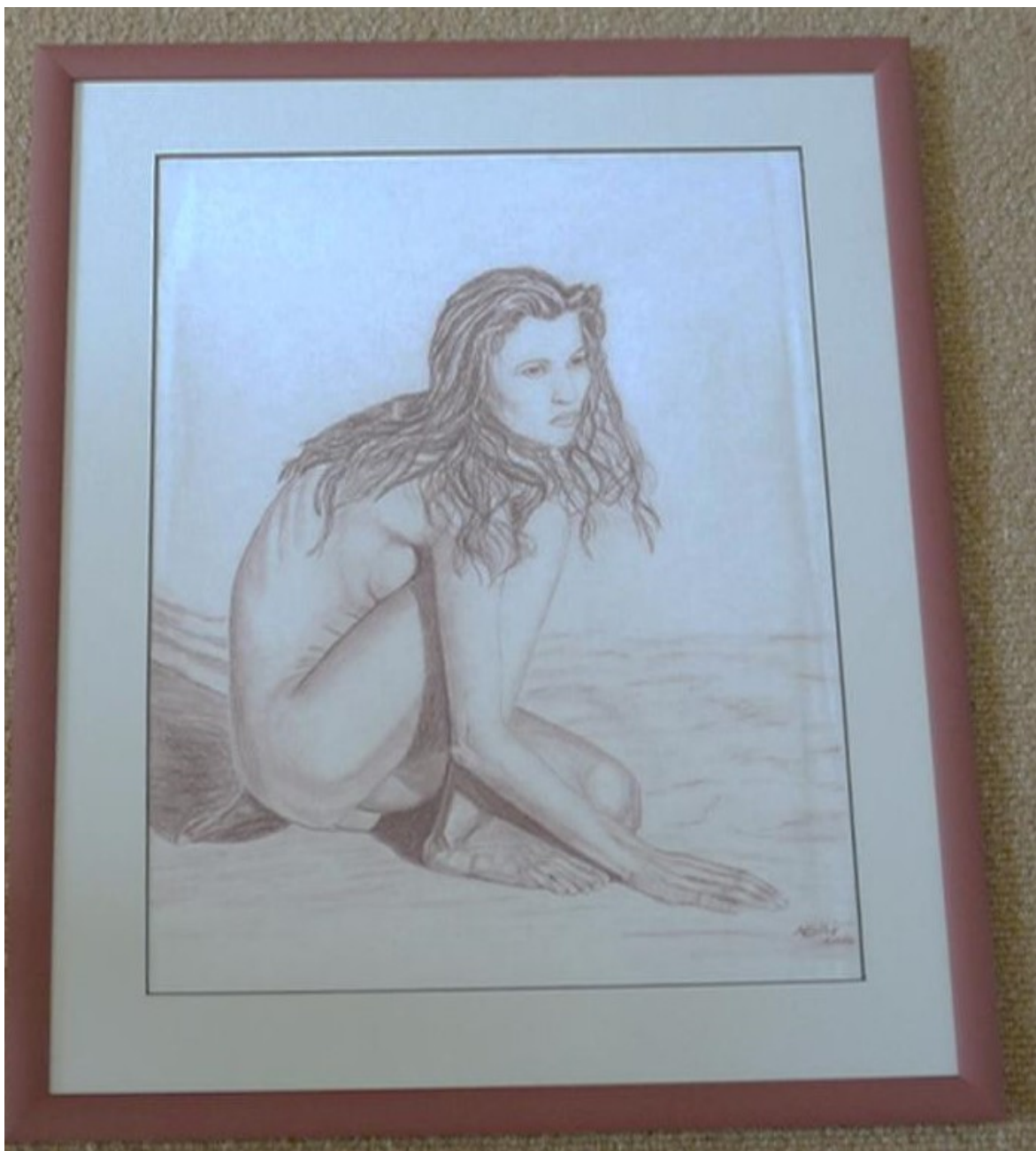
Title: "Kate Moss" Medium Pastels Price