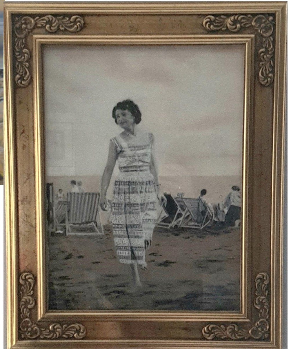
Title: "Ivy" Medium Oils Price