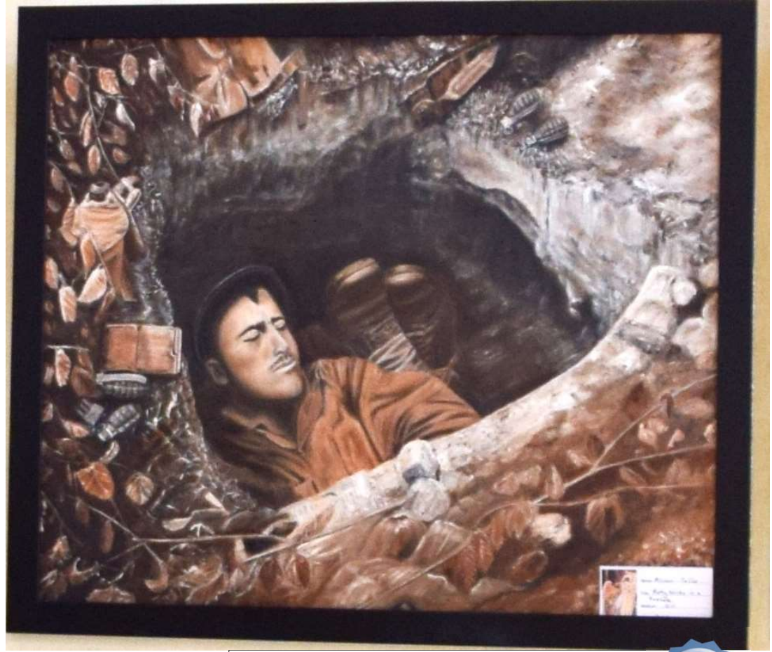
Title: "Sleeping Beauty" Medium Oils Price