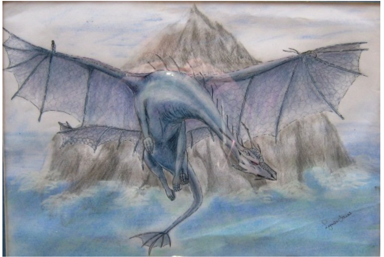
Title: “Blue Dragon” Medium: Pastels Price PoA