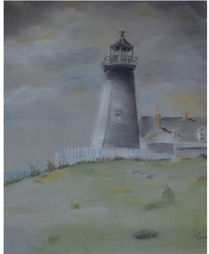
Title: “Whitstone Lighthouse” Medium Pastels Price £40 (framed)