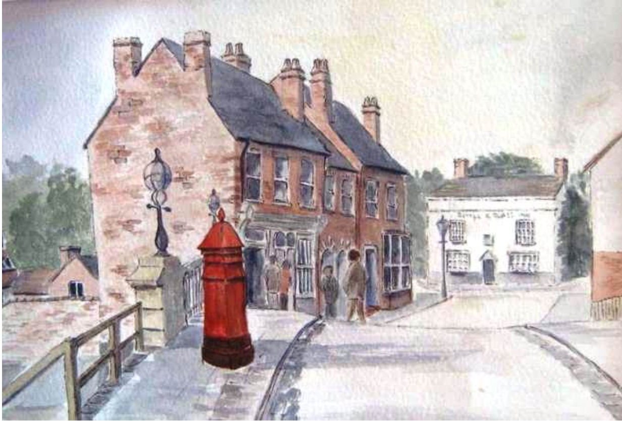
Title: “Black Country Museum Street Scene” Medium Watercolour Price £30 (unframed)