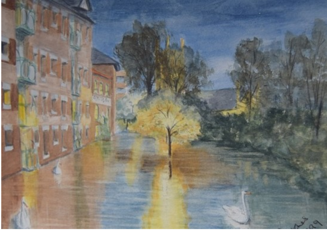
Title: “Worcester in the floods” Medium Watercolour Price £35