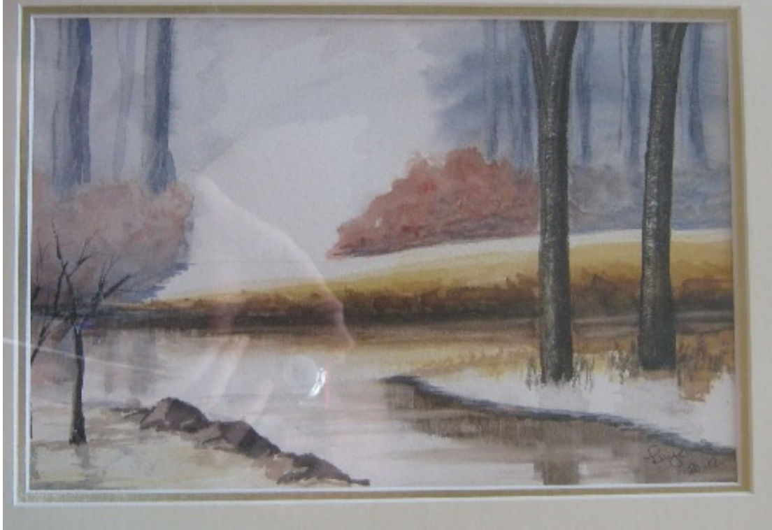
Title: "Winter woodland" Medium: Watercolours Price £55 (framed)