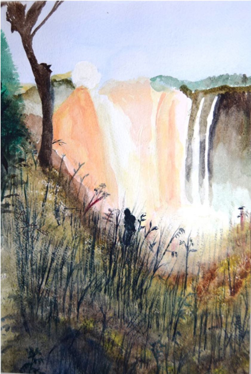
Title: “Victoria Falls” (Livingstone) Medium Watercolours Price £20 (mounted, unframed)