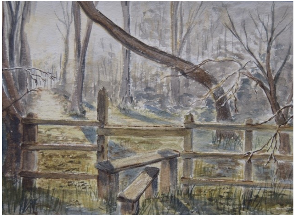
Title: “Tolladine Woods” (nr Worcester) Medium Watercolour Price £35 (mounted, unframed)