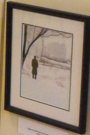
Small white caption card with illegible text.