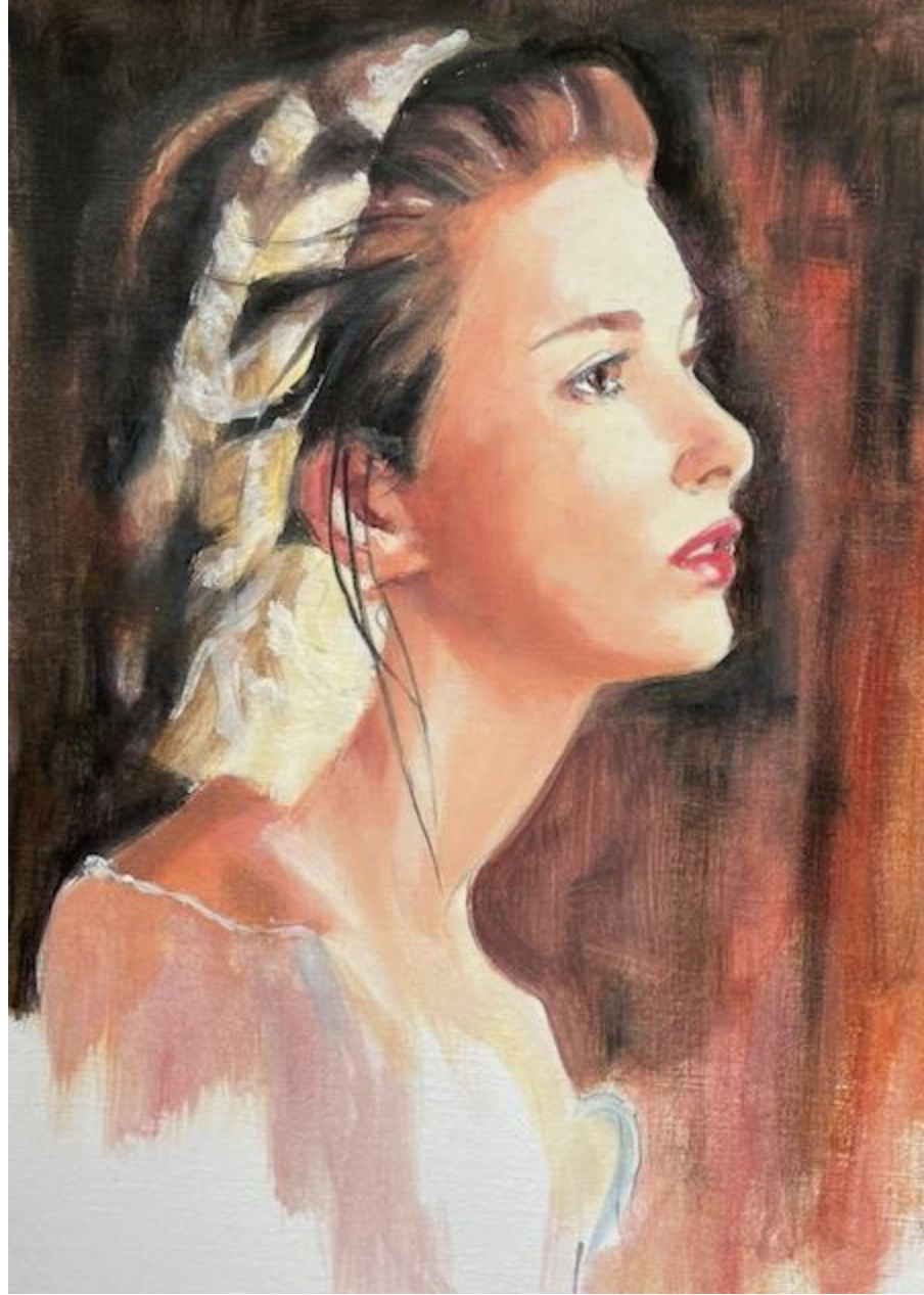
Portrait, quickly painted. Oil Paints.