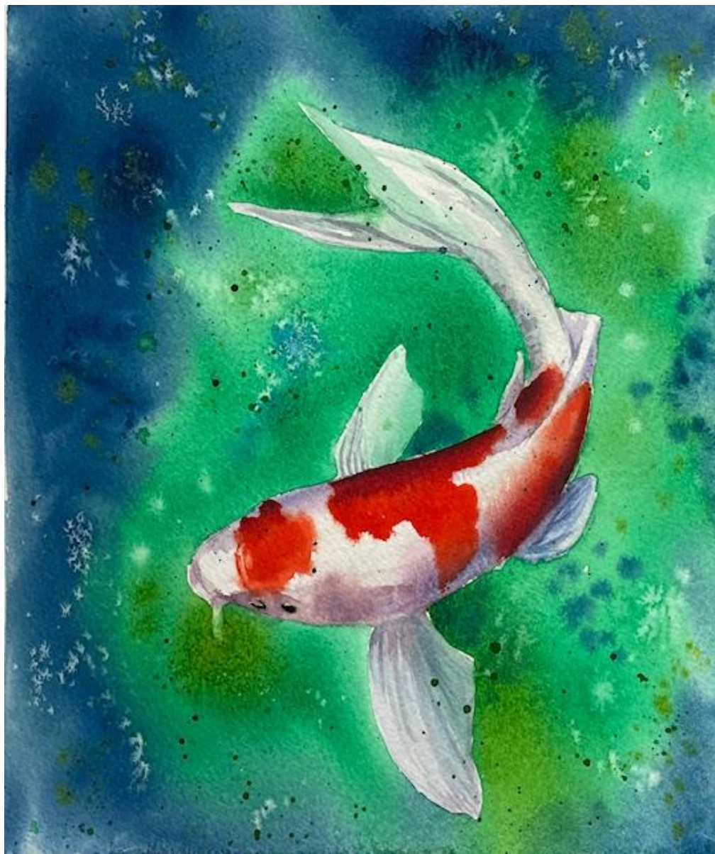
Wet in wet, Koi Carp. Watercolours.