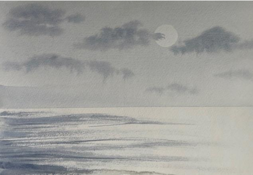
Above: Simple Moonlit seascape. Watercolours