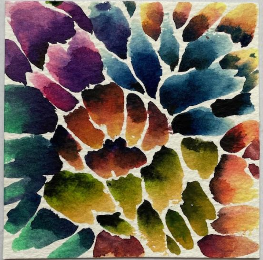
Three dip in paint, Chinese Art. Watercolours.