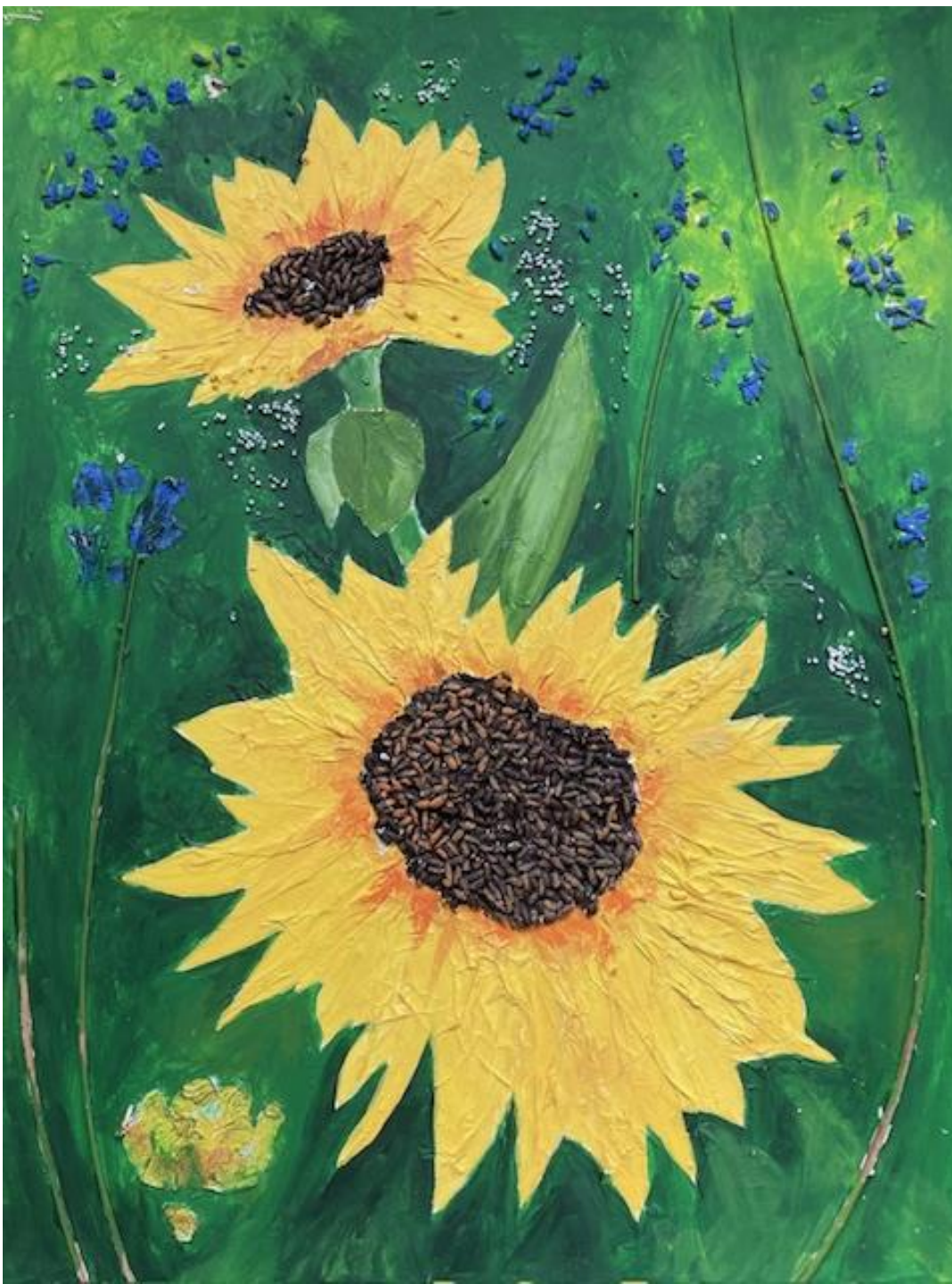
Sunflowers, Mixed media.