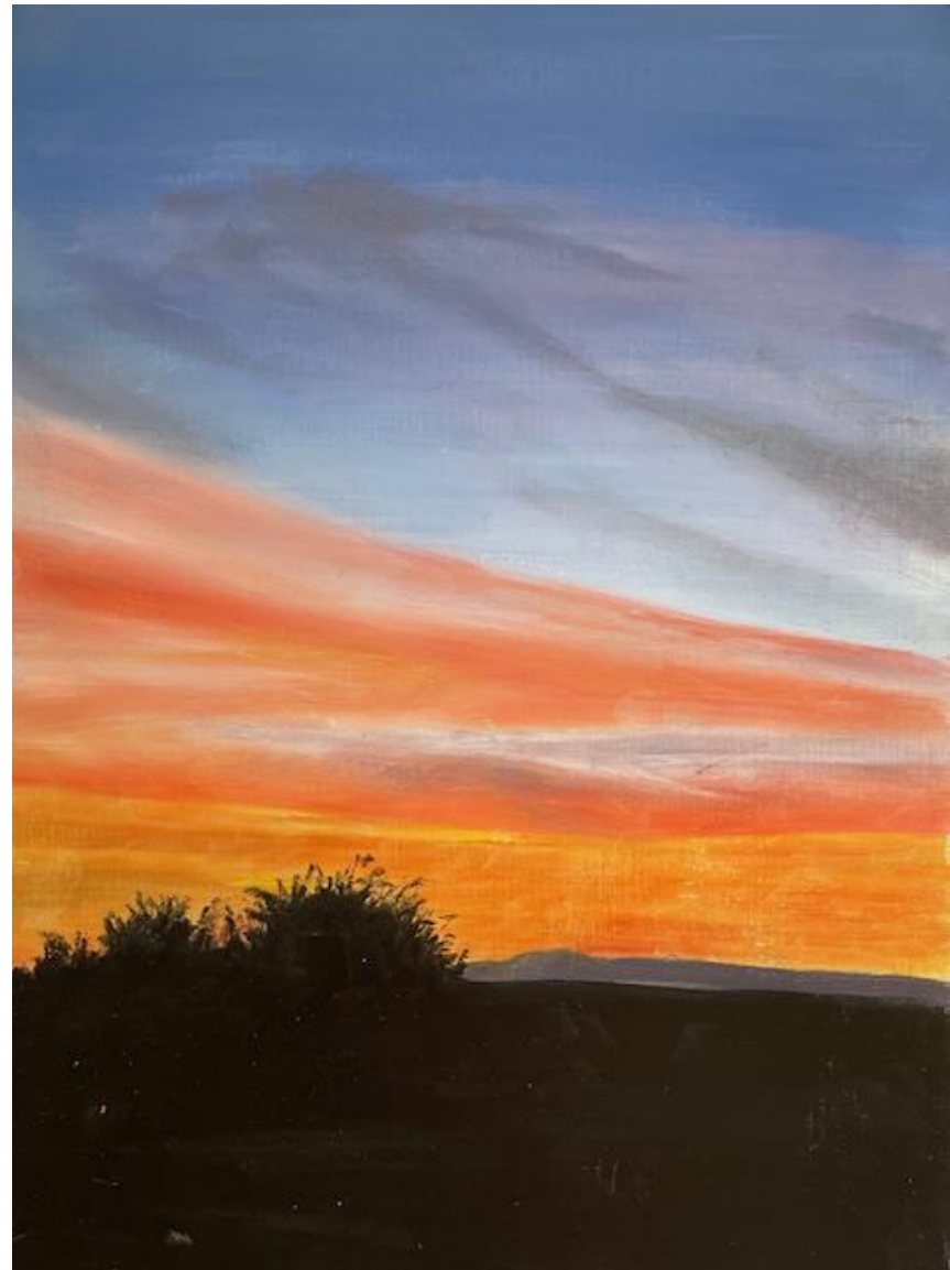
Right: Dramatic skies, sunset. Acrylics and Oil paints.