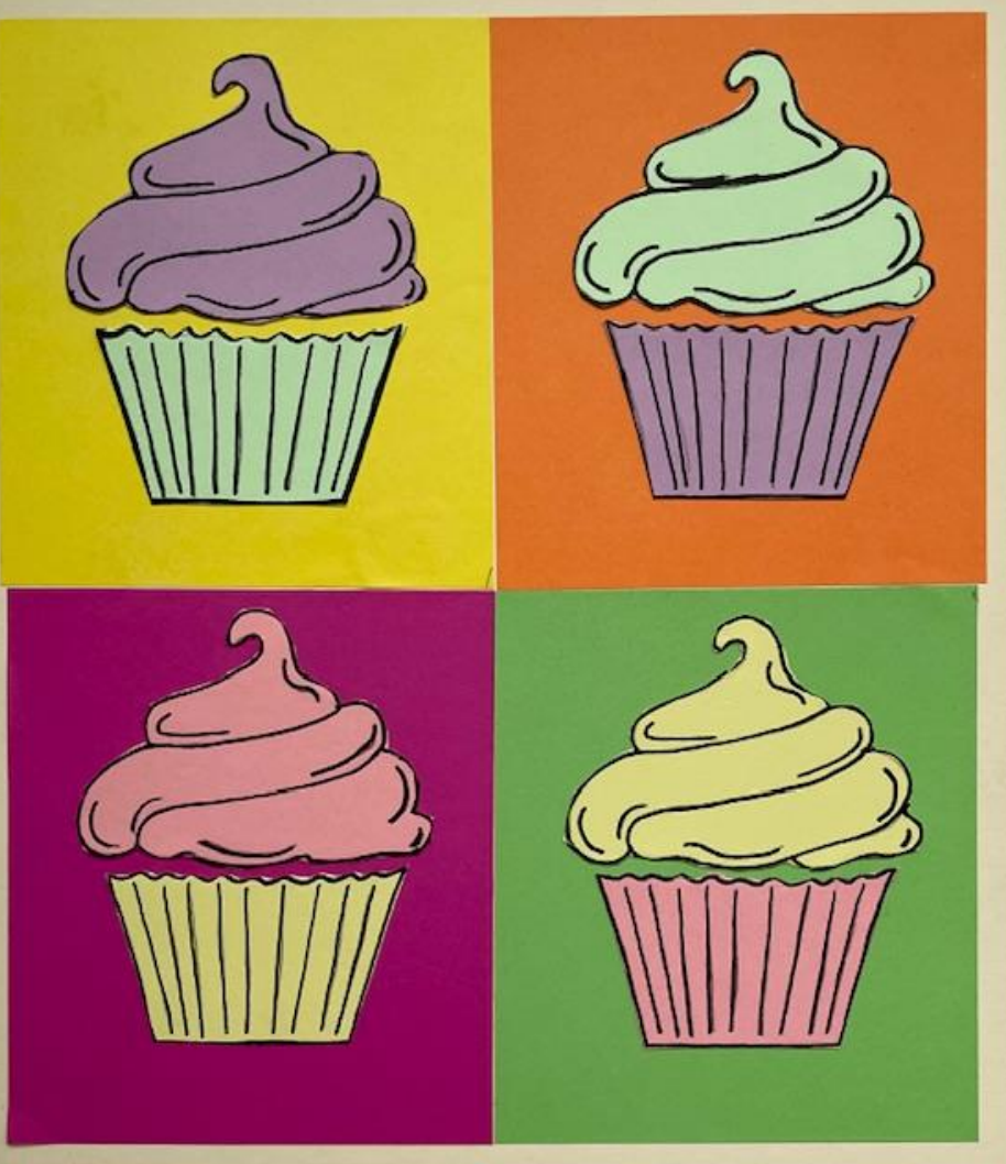
Above: Pop Art, Cupcakes. Collage.