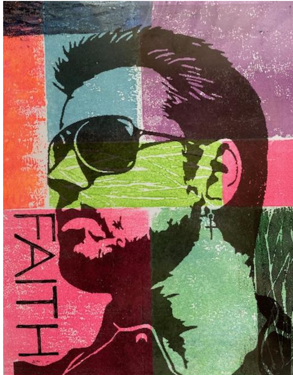
Right: Pop Art, George Michael. Printing inks.